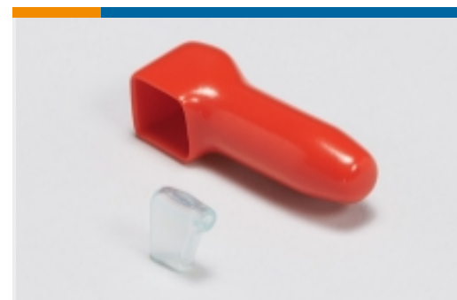
Insulation Boots &amp; Sleeves(4)